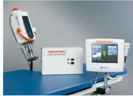
Table Mount The small power supply allows mounting flexibility – under the table, in control room, in store room