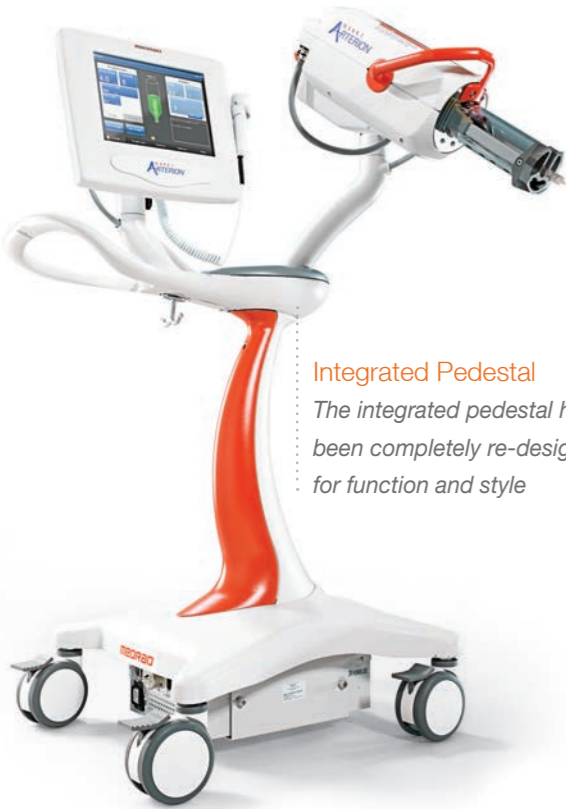
Integrated Pedestal The integrated pedestal has been completely re-designed for function and style

Arterion™ offers multiple configurations for maximum configuration flexibility