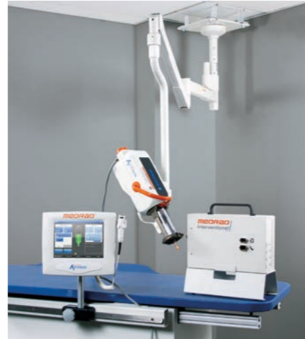
Freestanding Pedestal Ideal for moving the injector head on and off table when not needed